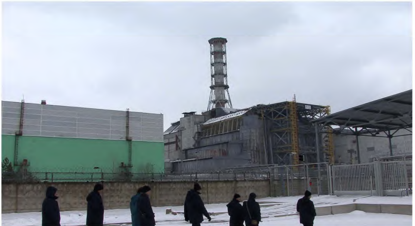
Chernobyl workers passing Reactor No.4 at the end of their shift

8,000 people work there today to mitigate and contain the spread of radiation.